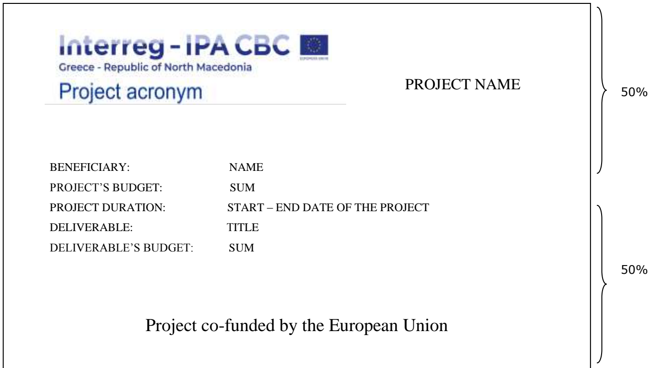
Picture 6: Information sign/ Billboard/Permanent Explanatory Plaque template